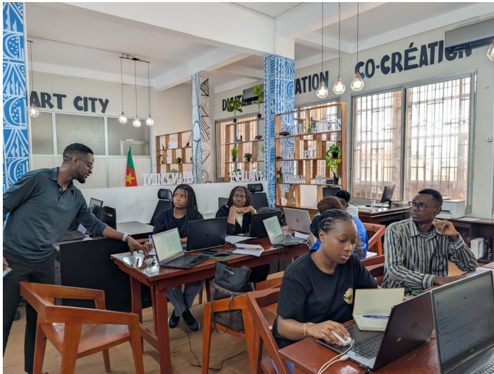
Training session in April 11, 2026, held on Yaoundé Diver City Space.

Congratulations to everyone on this important achievement! We are delighted to be part of this journey and sincerely hope you find success in the remaining phases of the program. May the seeds planted today grow into fruitful trees, revealing in each young participant a vocation for map the world!