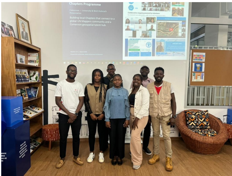
Launch of the CityMapper Externship on 10 April 2026, Yaoundé Diver City Space.